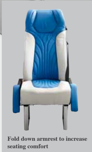
Fold down armrest to increase seating comfort