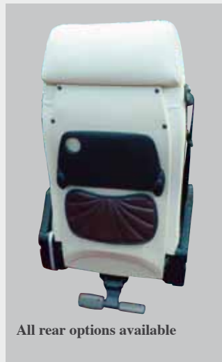
All rear options available