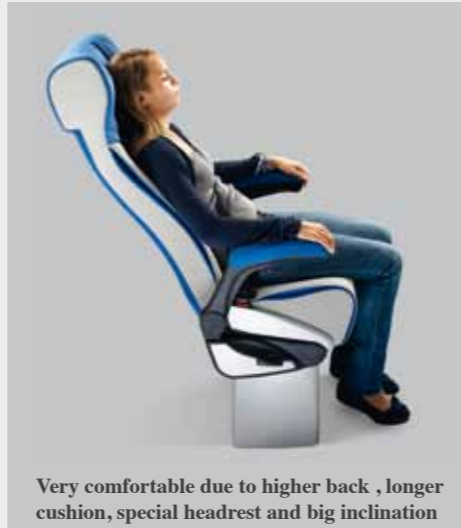
Very comfortable due to higher back , longer cushion, special headrest and big inclination